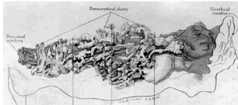
Figure 1 Huffman's wax model of the female prostate, longitudinal aspect [49].

their view was not held by other scientists. In 1982, Addiego and colleagues were the first to analyze ejaculate from a woman and found a significant chemical dissimilarity (prostatic acid phosphatase, urea and creatinine) between urine and ejaculate [45]. Several additional studies confirmed this phenomenon [46,47], reporting that components found in the ejaculate were similar and comparable with male ejaculate [47–49]. Current research strongly indicates that the paraurethral ducts described by Skene are in fact the female prostate as proposed by de Graaf [48,50]. During the last 30 years the most profound and extensive research on the female prostate has been conducted by Zaviacic and his group providing significant anatomical, histopathological, and functional insights. They showed the differences between the male and female prostate, as they described the prostate of females being significantly smaller than the male prostate and lying within the wall of the urethra, while the male prostate surrounds the